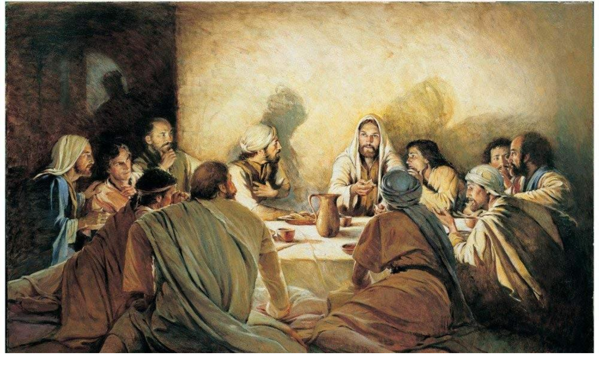
Jesus Sings Psalm 113