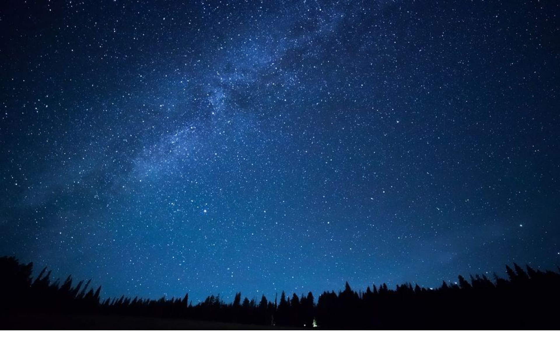
"The Lord is high above all nations; His glory is above the heavens."